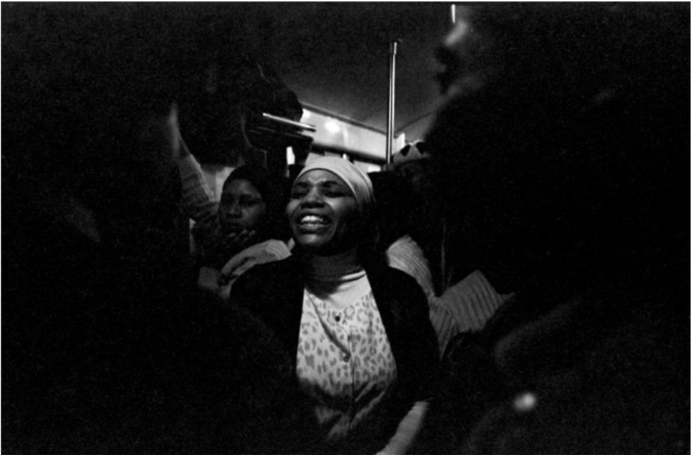
Exhortations, Johannesburg - Soweto Line / 1986 silverprint edition 5

In Chasing Shadows (1996-2004), Mofokeng deals with the issue of spirituality from another perspective. Spanning nearly a decade, these pictures were taken in the caves of Motouleng, Manspopa and various pilgrimage sites in the Free State province of South Africa, worshipped as holy places by both Christian communities and the followers of other ancestral religions. The "shadows" are souls, entities, spirits, and energies that are part of the world. They evoke something that is both imaginary and real, blurring the line between sacred and profane, human and divine. In Church of God , the sacredness of the place becomes one with the "aura" of the individual, their invisible forces leaving tangible traces in the world.