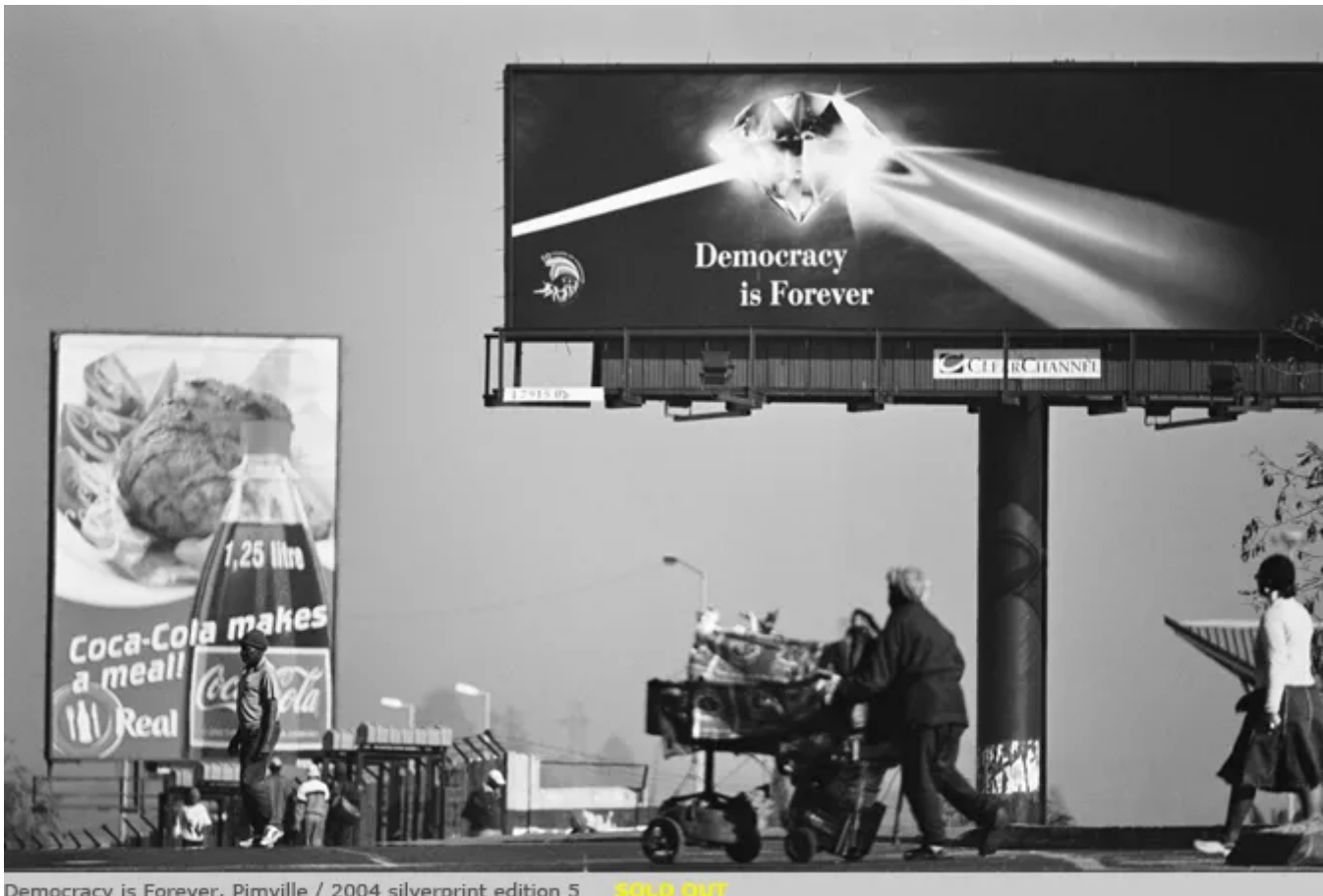
Democracy is Forever, Pimville / 2004 silverprint edition 5 SOLD OUT

Se continuiamo a tenere vivo questo spazio Ã” grazie a te. Anche un solo euro per noi significa molto. Torna presto a leggerci e SOSTIENI DOPPIOZERO