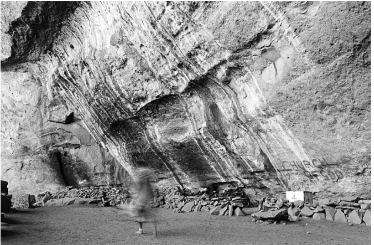
Church of God, Motouleng / 1996 silverprint edition 5

As Mofokeng points out, in South Africa, unlike in the European tradition, "shadow" indicates something real. Seriti – the word for "shadow" in sesotho , his mother tongue – does not just refer to the absence of light, but can mean anything from aura, presence, confidence, or dignity, also referring to the power to attract good luck and ward off evil forces and illness. This is evident in Rumours/The Bloemhof Portfolio (1988–1994), where the voices evoked by Mofokeng are translated into a photographic language. Bloemhof is a small town of the Transvaal region in South Africa, where Mofokeng documented the lives of tenant farmers, often referred to as "yokels", and observed people's excitement and fear on the eve of the first democratic elections in 1994, as emblematically shown in Mothâ?osele Maine . Here, a light seems to emerge from the shadow of the subject, overlapping his image and brightening the room, but it might as well be the photographer's or the viewer's reflection, a trace of their own gazes and expectations.