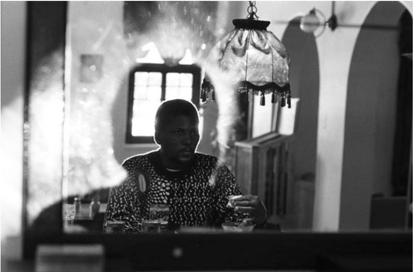
Moth'osele Maine, Bloemhof / 1994 silverprint edition 5

It is within this framework that Mofokeng's visual journeys are inscribed, along with his attempts to give substance to South African landscapes of violence and tragedy. Here, the concept of seriti-shadow suggests a form of "remembrance," namely "as Mofokeng states" a process through which forgotten memories come back to life. The body is the landscape on which the most relevant stories and myths in the construction of national identity are inscribed. In Vlakplaas (the infamous Apartheid detention and execution centre), the natural landscape is only ruined by the presence of a wire fence, a sign of the prison area as well as a metaphorical scar in the memory of the country; in a similar way, in the Robben Island triptych, only the corners of the wall separating the detention space from the outside world are visible.