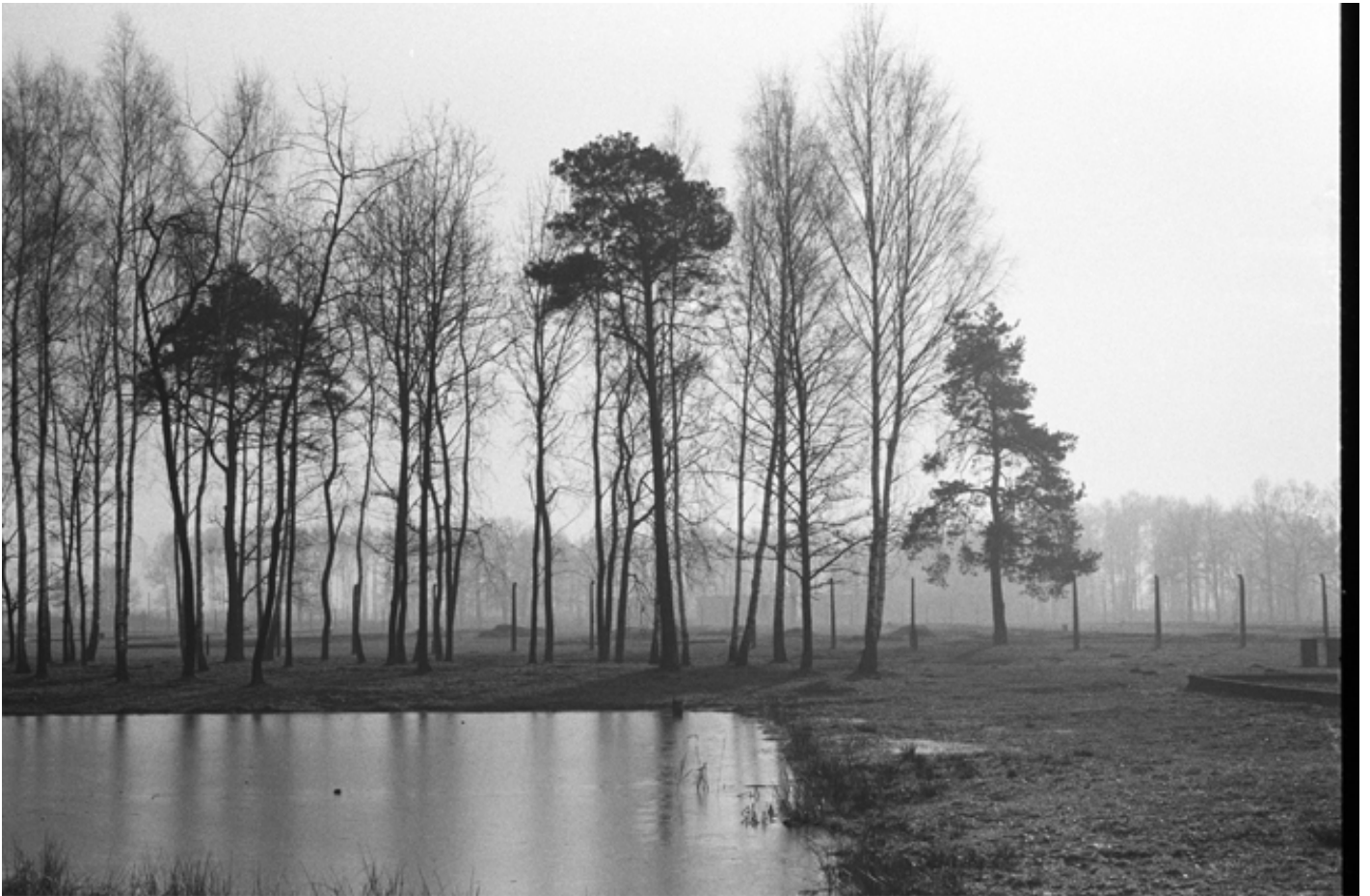
Lake Once Filled With The Ashes of tThe Cremated, KZ2-Auschwitz / 1997 silverprint edition 5

The same goes with the Poisoned Landscapes (2010-2011) and Climate Change (2007) series, which include pictures of disused mines and toxic waste sites, documenting the effects of climate change. Here, Mofokeng brings out what the viewer cannot easily glimpse, enhancing the ambiguity of the images and juxtaposing desolation and beauty, such as in Landscape Left by RÅ/ssing Uranium Mine , an ideal response to the Trauma Landscapes .