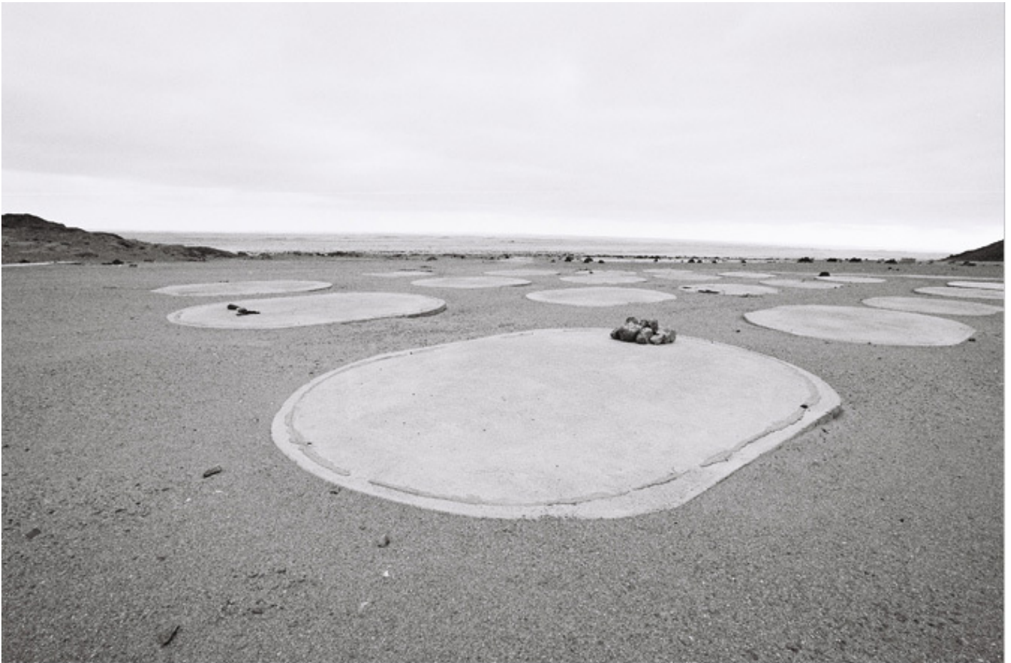
Landscape Left by Rossing Uranium Mine after its Closure, Kolmanskop, Namibia / 2011 silverprint edition 5

Drawing on Georges Didi-Huberman, Mofokeng's photographs could be described as "figuring figures." The automatism of the camera irremediably breaks with the idea of a "figured figure" (whereby nature is observed, imitated, and the result is a nice picture), replacing it with that of multiplicity. The image is therefore conceived as potency, as a potential part of a series, so the focus is not on the relation between a single image and the represented reality, but on the relation of each picture to the others, on the sequence. In this way, images overlap and refer to each other, thus enhancing their meaning and freeing themselves from the mere realism of representation.