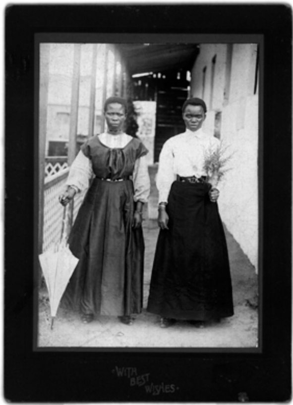
Slide 8/80 / 1997 black and white slide projection, installation edition 5