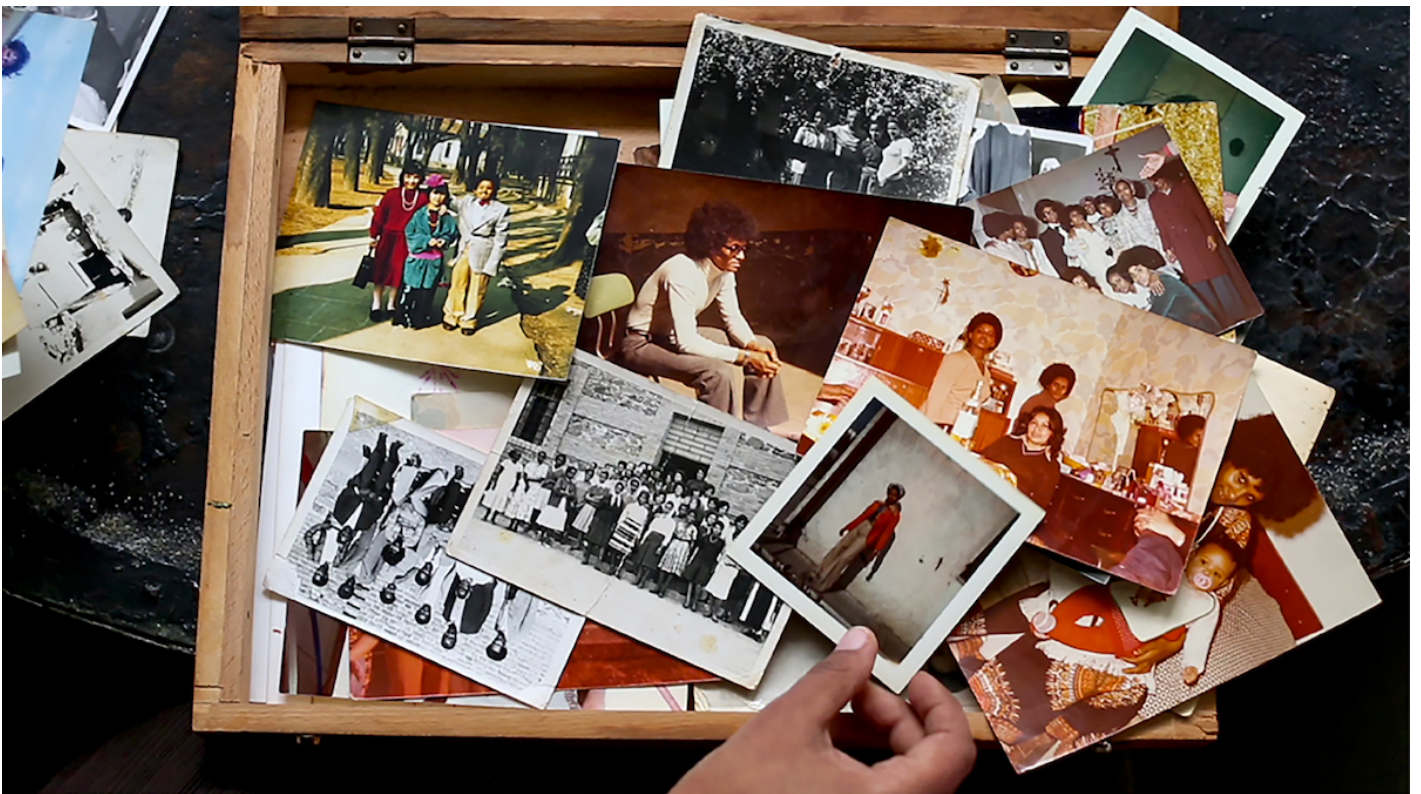
Still from Asmarina (2015).

In Maglio and Paolosâ• documentary, photos are a form of collective praxis, deeply embedded in social relations and indeed formative of social relations. Photosâ•family photos, photojournalism, candid snapshotsâ•are the material by which kinships and connections are traced among people, places, and time; they allow for the transmission of embodied knowledges and histories. (In one memorable scene, a young boy repeatedly asks his mother and grandmother to identify the relatives in a series of photographs; in loving exasperation, the mother responds, â•Sonâ• tutti zii, amore! â•). Photos, then, are one of the archives by which diasporic connections are established, remembered, and longed for.