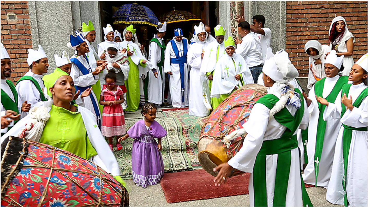
Still from Asmarina (2015).