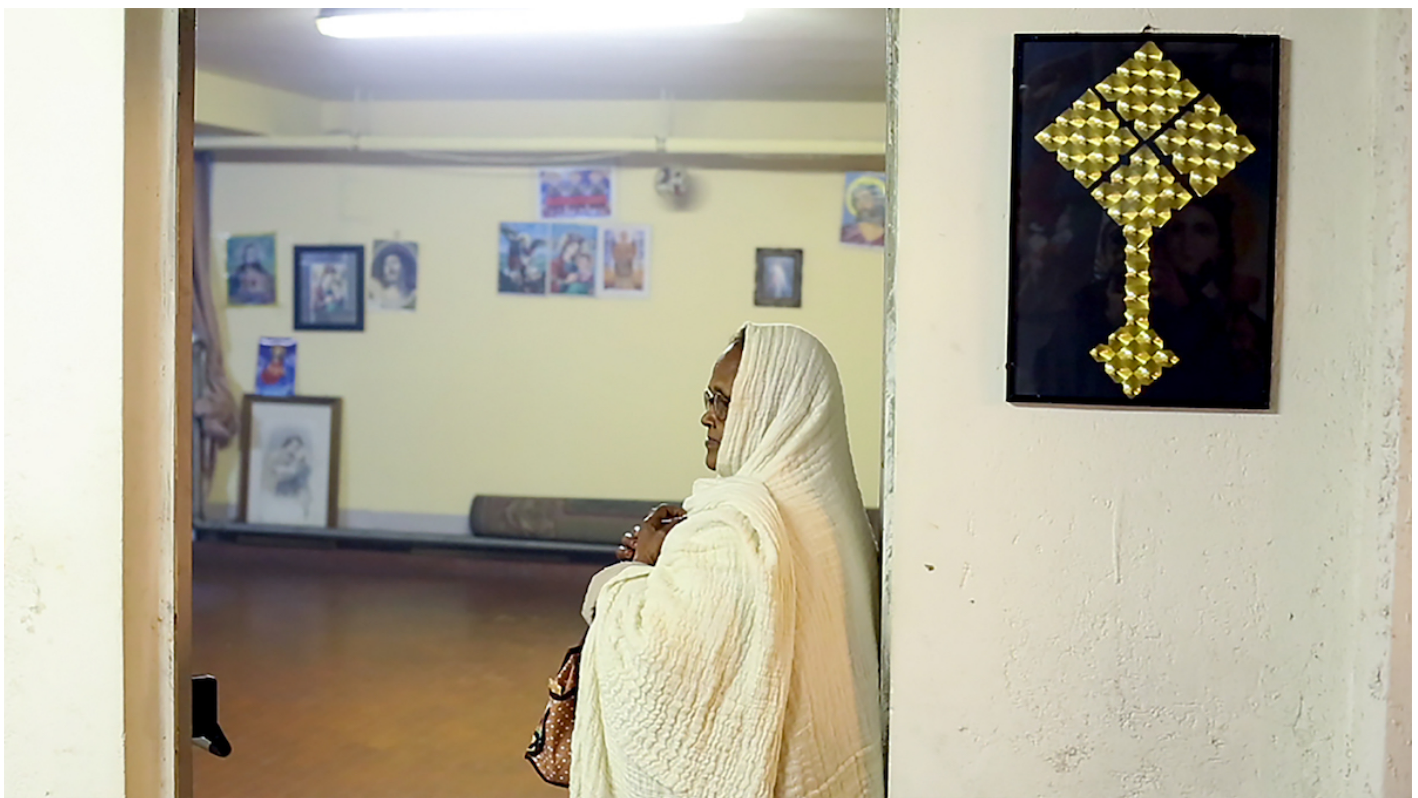
Still from Asmarina (2015).