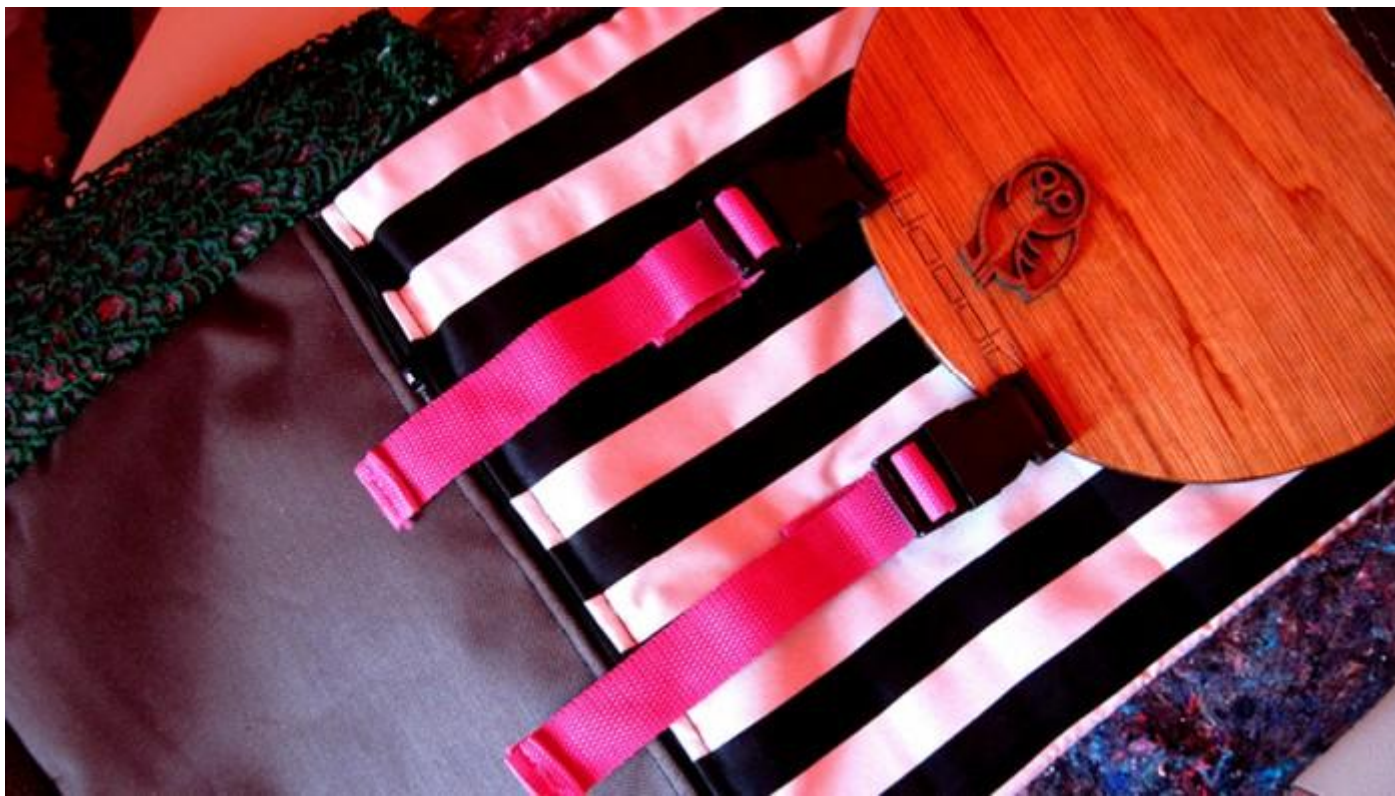
Sibisis Brian Mokhachane , backpacks, Accessories designer and Social entrepreneur, South Africa.

EK: You have just anticipated one of our questions: why do you think the global audiences tend to promote the idea of African design as some kitsch exotic souvenirs instead of telling the stories of the aesthetically powerful objects you produce every day?