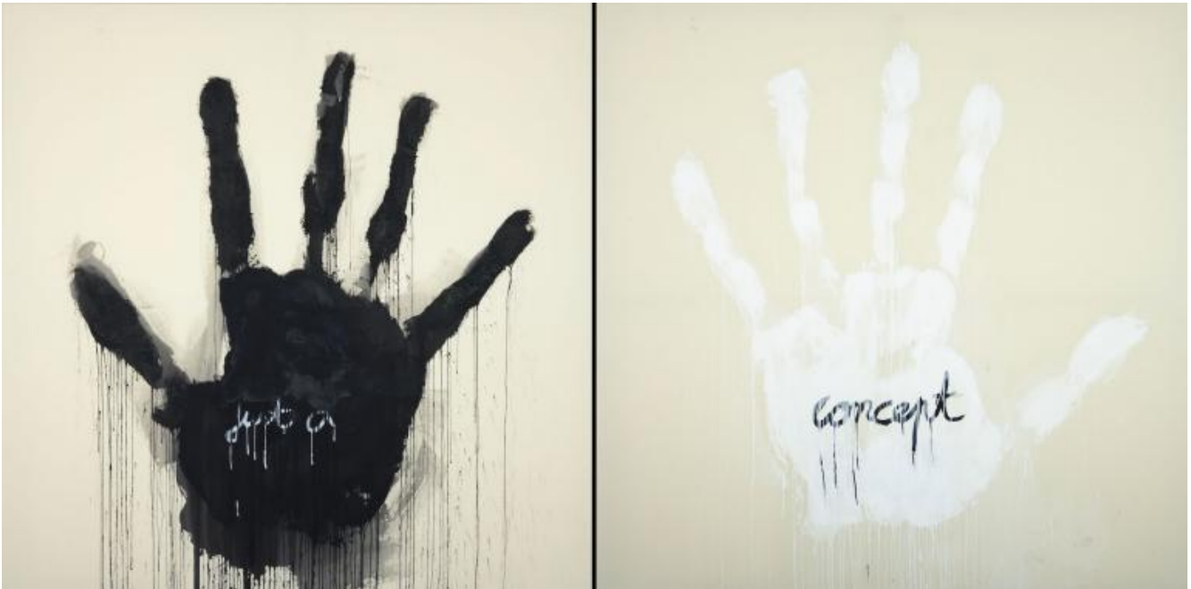
Mwangi Hutter , just a concept 2016, courtesy of the artists.

Let me take another example: the transformations that are affecting urban forms. These have been caused partly by the emergence, in the continent, of megacities and mega-regions whose density, massive spatial expansion, sheer scale of population, high levels of risks and great wealth disparities have been accompanied by dynamic and unexpected modes of urban growth. Major cities such as Lagos, Johannesburg, Kinshasa, Nairobi, Luanda, Dakar and Abidjan have continued to expand in a relatively uncontrolled, decentralized if not random way since the 1980s. Today, these cities are better understood as largely de-territorialized mega-regions with multiple urban enclaves.