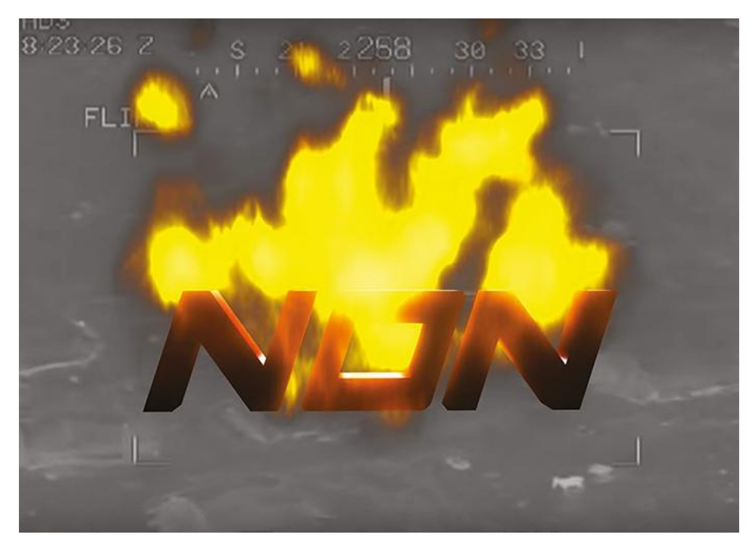
AA BYT July29 NON 1 Chino Amobi, a still from Illuminazioni, 2012. Digital Video, 17:02.

NON is a collective of artists from Africa and the diaspora who use sound as their primary medium. In their own words they aim to â??articulate the visible and invisible structures that create binaries in society and in turn distribute power, creating sound opposing contemporary canons.â?•