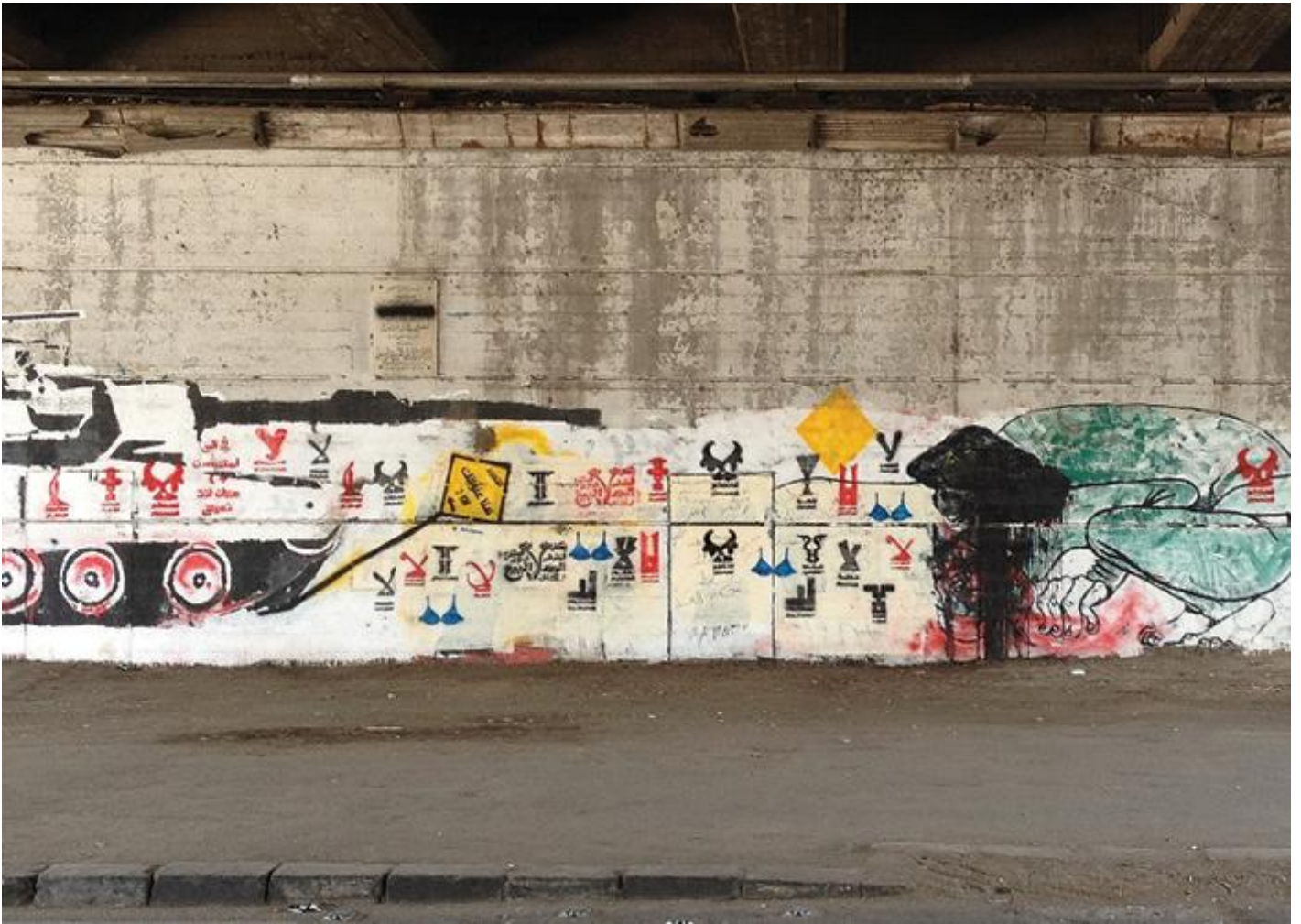
Stencilling on the Tank Wall.

The story of a particular wall in Cairo captures the essence of the ongoing battle between artists and the authorities. It started with Mohamed Fahmy, a prolific street artist known as Ganzeer, who decided to paint a life-size tank on the wall under the sprawling 6 October Bridge. Coming from the opposite direction, he painted a man on a bicycle carrying a breadbasket. A few weeks later violence erupted and the security forces killed protesters. Other artists used the same wall to paint splattered blood under the tank as it crushed protestors. The authorities immediately blotched the image of protesters with white paint but left the tank. Yet another artist added his contribution by using the blotched white space to draw a monster in military uniform. The authorities retaliated with a bucket of black paint to hide the head of the monster. Bahia Shehab, an art historian turned revolutionary stencil artist, placed her trademark calligraphy of the word "NO" across the whole wall.