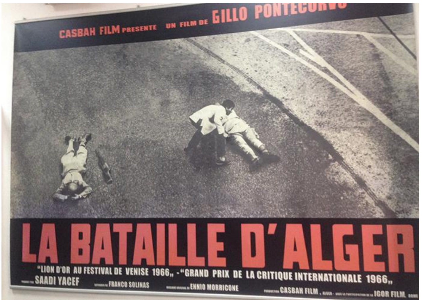
Poster of Gillo Pontecorvo's film The Battle of Algiers , 1966.

Art has always been the language capable of connecting ideas and spaces. The first "Pan African Cultural Festival" held in Algeria in 1969 was the embodiment of the hopes of African unity. It gathered all forms of the arts from the north, south and the diaspora and unapologetically celebrated the continent with its artistic diversity. The event was a landmark and promised to usher in an era of cultural production. Unfortunately very little happened in the following decades. Soon, even the glamorous Cinéma "que d'Alger crumbled, theatres closed and art galleries were nowhere to be found. Even local talent could only find space for their artistic expression if they crossed the Mediterranean to make a name for themselves in Europe.