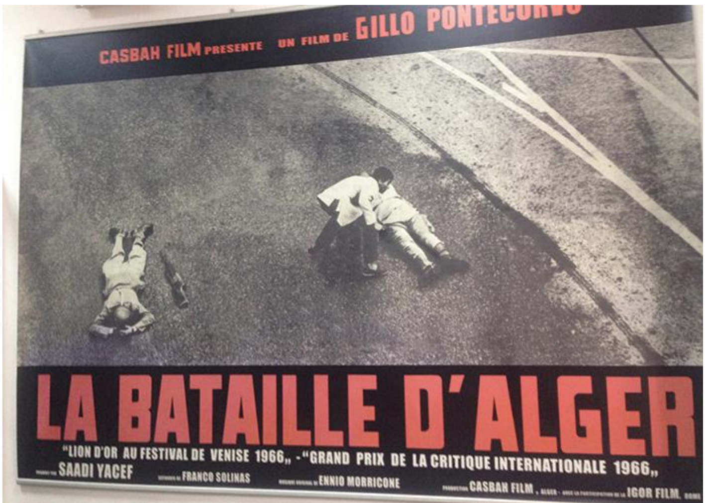
Poster of Gillo Pontecorvo's film The Battle of Algiers, 1966.

Art has always been the language capable of connecting ideas and spaces. The first 'Pan African Cultural Festival' held in Algeria in 1969 was the embodiment of the hopes of African unity. It gathered all forms of the arts from the north, south and the diaspora and unapologetically celebrated the continent with its artistic diversity. The event was a landmark and promised to usher in an era of cultural production. Unfortunately very little happened in the following decades. Soon, even the glamorous Cinémathèque d'Alger crumbled, theatres closed and art galleries were nowhere to be found. Even local talent could only find space for their artistic expression if they crossed the Mediterranean to make a name for themselves in Europe.