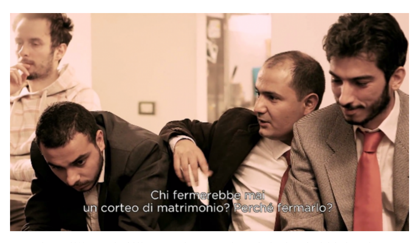
Io sto con la sposa (2014), screenshot dal film.

After Venice, both filmmakers have presented their works at many other important venues. Io sto con la sposa participated in international festivals such as the <u>IDFA</u> and <u>Dubai Film Festival</u>, was presented all around Italy through grassroots screenings , and in some cities was a record breaker at the theaters, becoming one of the most successful films of the year. In the meantime, Va' pensiero has just finished a tour across different European cities and has recently turned into an educational kit for schools.