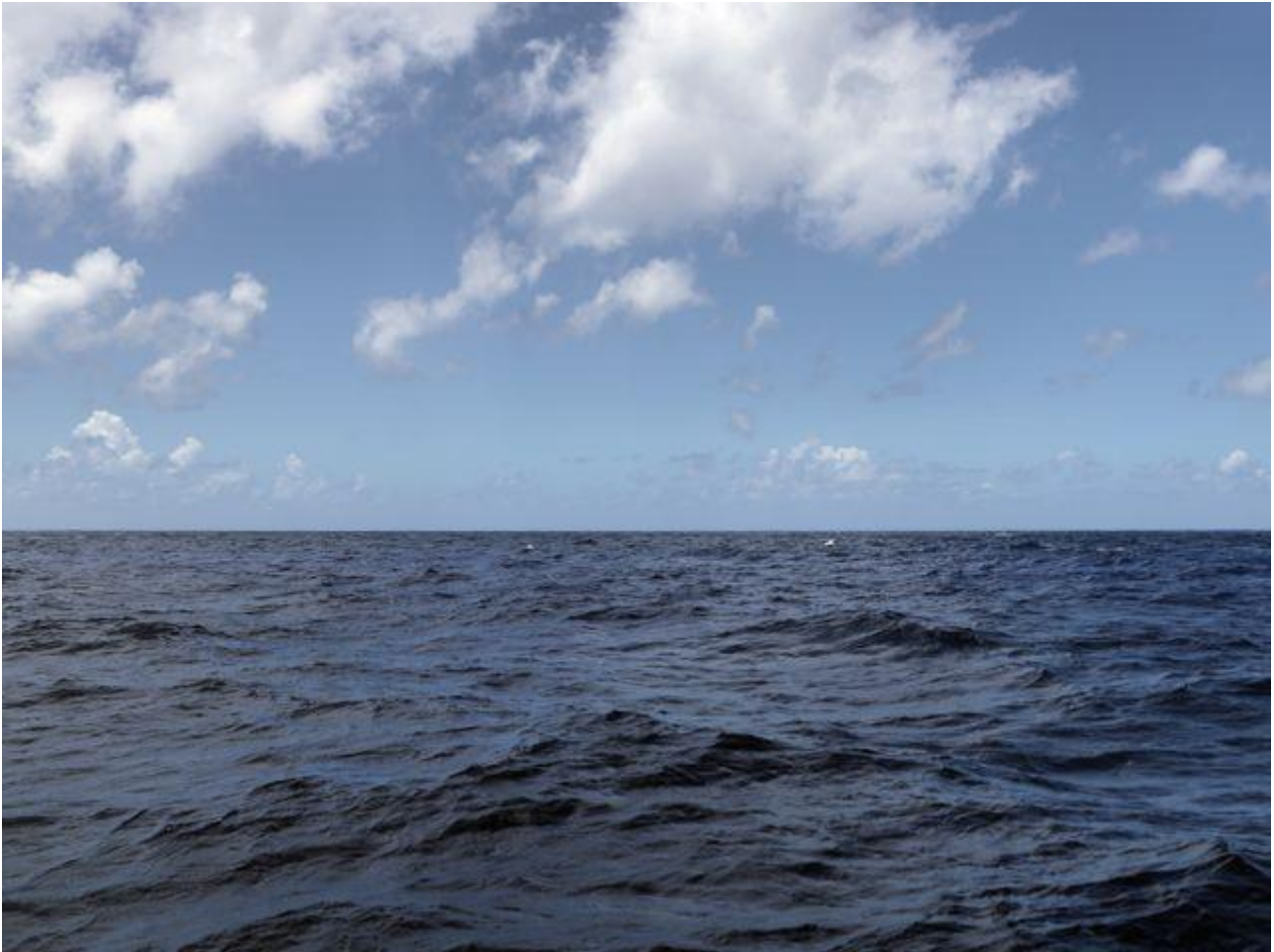
Guy Tillim, Near Huahine, 2011

me speaks through me, or at least I should aspire to this state. The invisibility of self is desirable in what is mediated.