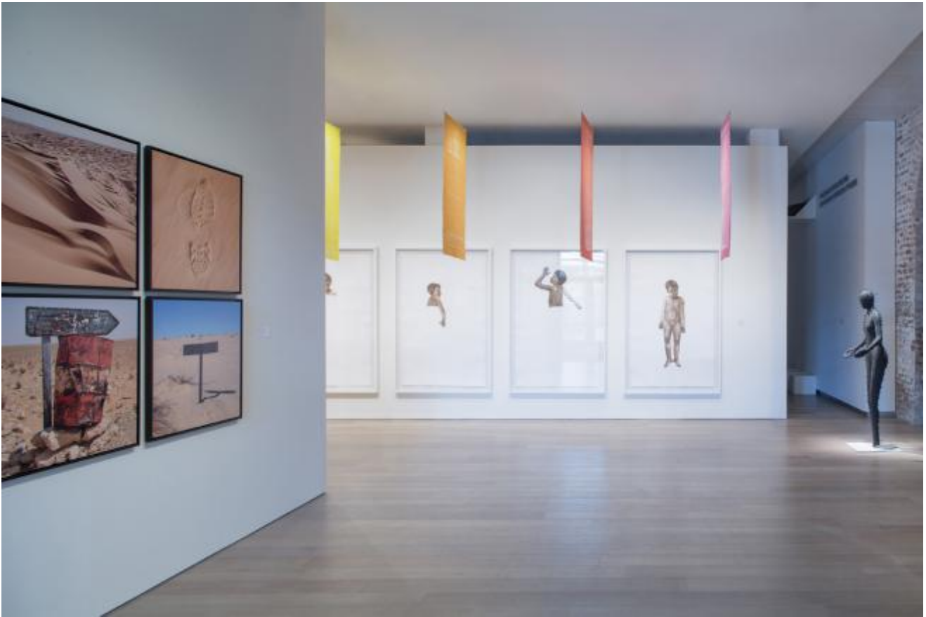
The Divine Comedy, exhibition view

C&: The exhibition's point of departure is Dante's Divine Comedy. In the run-up to the exhibition, how relevant was it for you to actually engage with Dante's work?