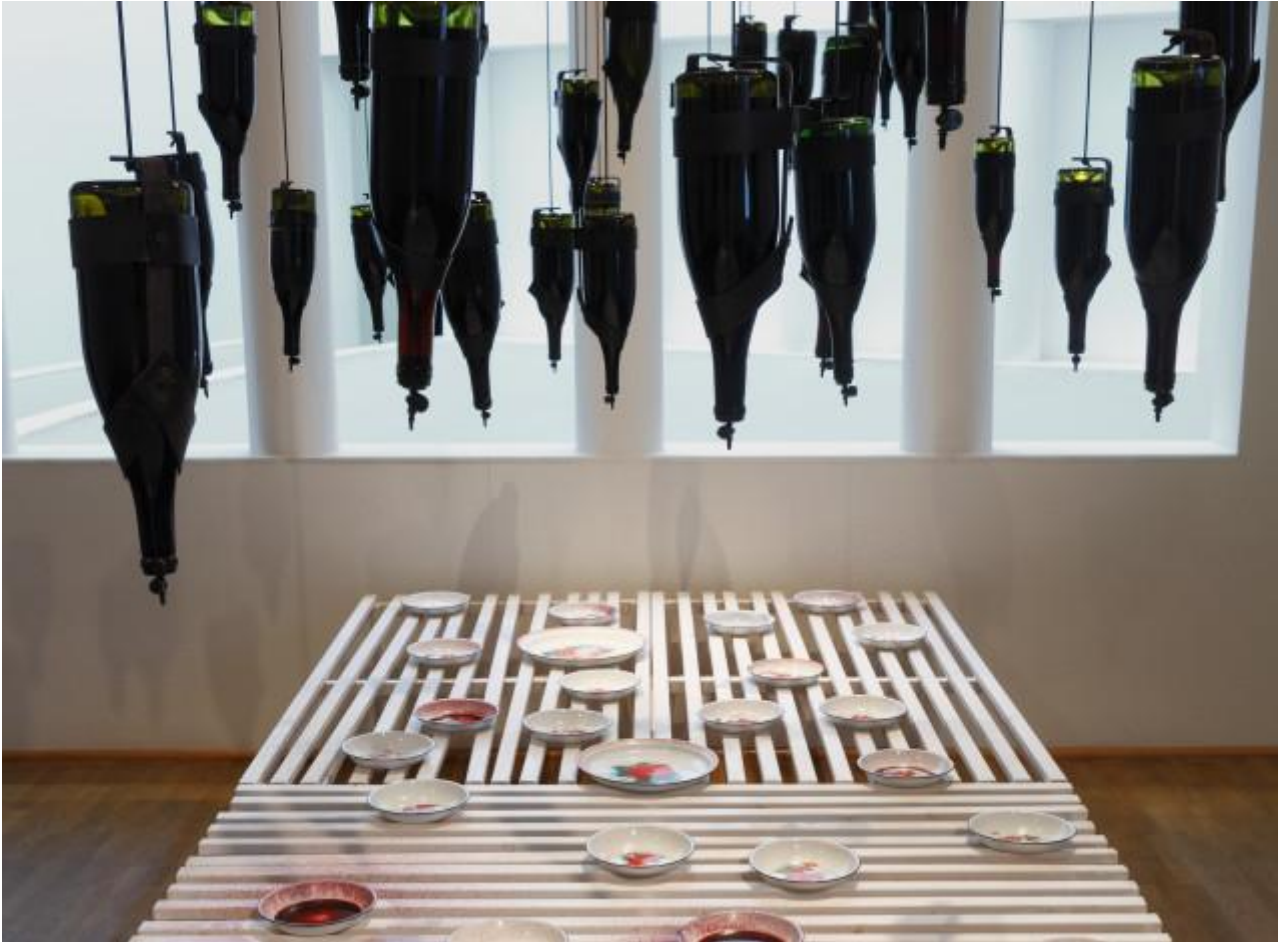
Wangechi Mutu, Metha , 2010

'us' when are here, the living dead are the people who have died but retain a certain amount of power amongst us because they've just died. But mostly, the reason why they retain power is because the living dead are the people who are dead and who we still remember, the ones we pray to, or are still in touch with. They are living dead â?? they are still amongst the 'alive'. So the 'living dead' is probably my favorite. I think that my work lives in that realm if anything â?? not the after life, itâ??s the life, right after-life.