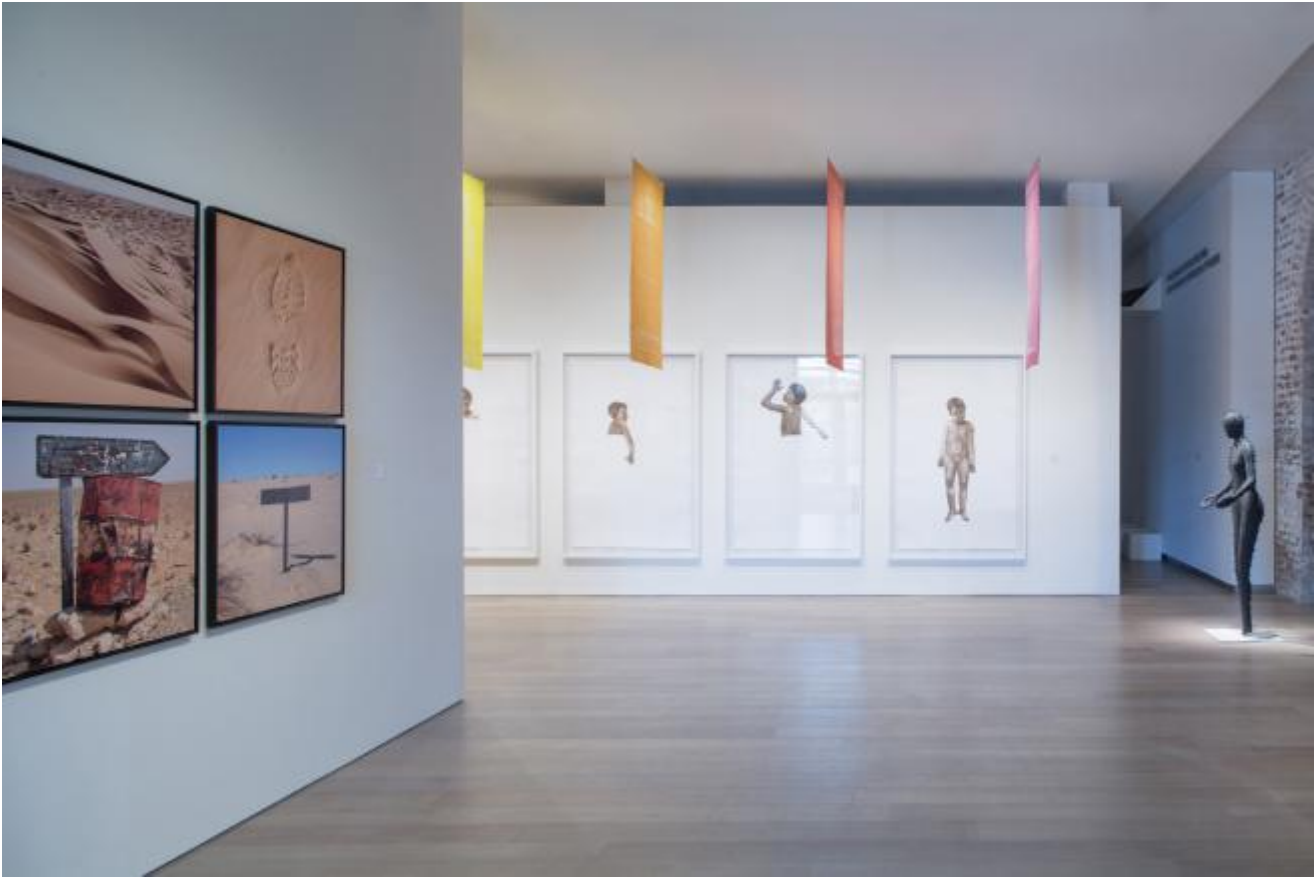
The Divine Comedy, exhibition view

an essay by Roberto Casati. We are now back to explore it through a series of interviews by some of the exhibition's artists, done by Contemporary And (C&) , the online art magazine with the focus on contemporary art from African perspectives, during the premier at MMK in Frankfurt and generously offered to us for republication. We have selected some of the artists' answers to build a journey through the subjective and multifaceted points of view of each artist that had to confront Dante's masterpiece. It's a collective tale of the project and its complexity, a project that mixes worlds and perceptions, moving through countries and cultures, the individual and the collective.