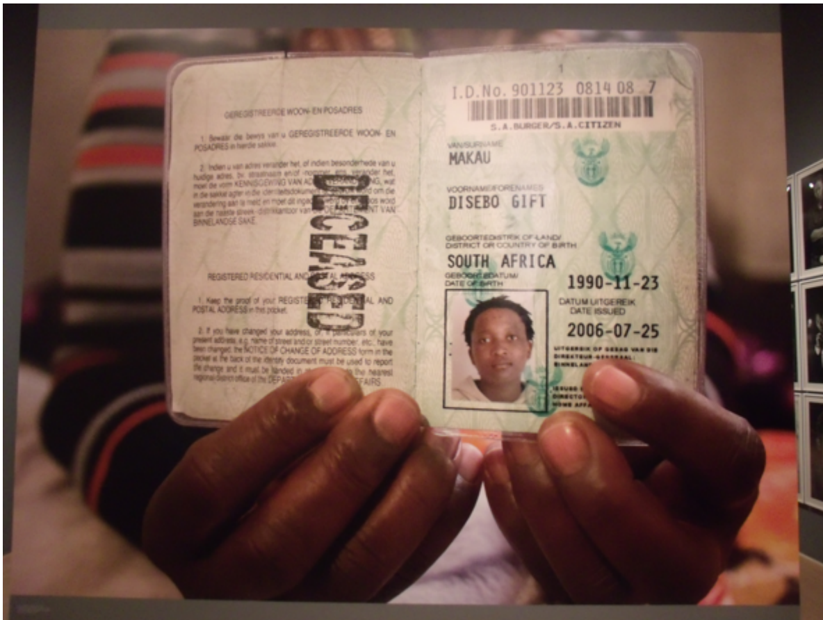
Installation of Zanele Muholi's Isibonelo/Evidence at The Brooklyn Museum exhibit, 2015.

While art circles have made strides in representing and exhibiting artists of African descent—from an increasing number of solo shows (Ibrahim El-Salahi at Tate Modern, El Hadji Sy at Weltkulturen Museum, or Zanele Muholi at The Brooklyn Museum), to Africa’s prolific presence at biennials worldwide (including the landmark participation in Okwui Enwezor’s All the World’s Futures for the 2015 Venice Biennale)—there remains a group of people for whom Africa is still an imaginary place.