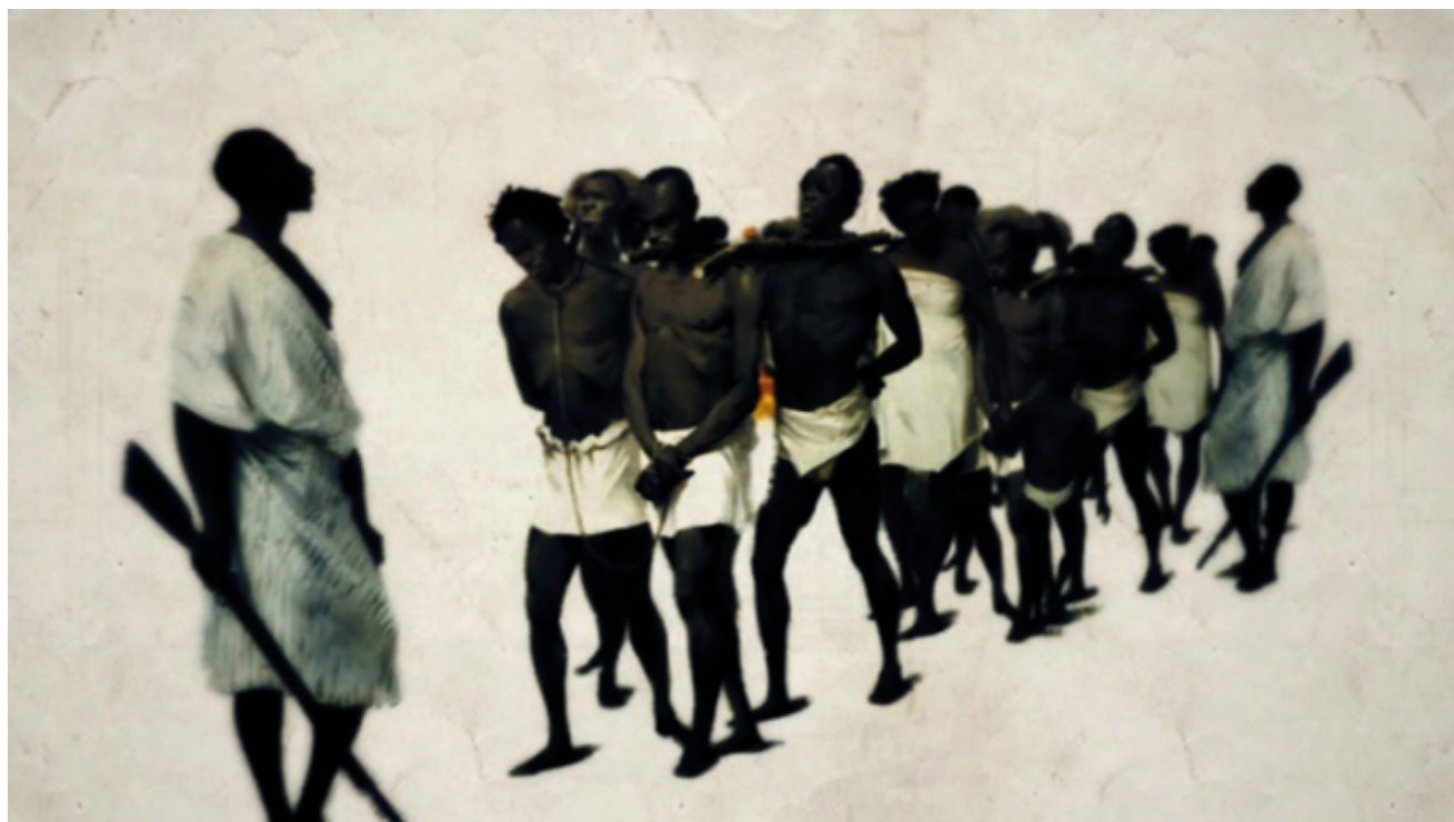
Bofa Da Cara, My African Mind, 2010, screenshot from the video, 6â??11â??â??.

Looking back over the 20 th century, it seems that the predominant story concerning the continent of Africa is an imagined one. From explorers to missionaries, from colonizers to reporters, the record of Africa (and by record, I mean the way that Western minds are accustomed to charting history: books, journals, newspapers, archives, etc.) was written, photographed, and performed by outsiders. Bofa da Cara (Pere Ortã & Nãstio Mosquito) captured this historic monopoly on defining the "Dark Continent" in their video montage, My African Mind (2010).