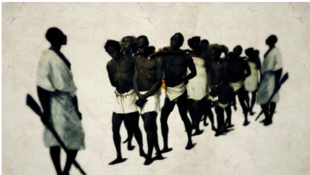
Bofa Da Cara, My African Mind, 2010, screenshot from the video, 6'11''.