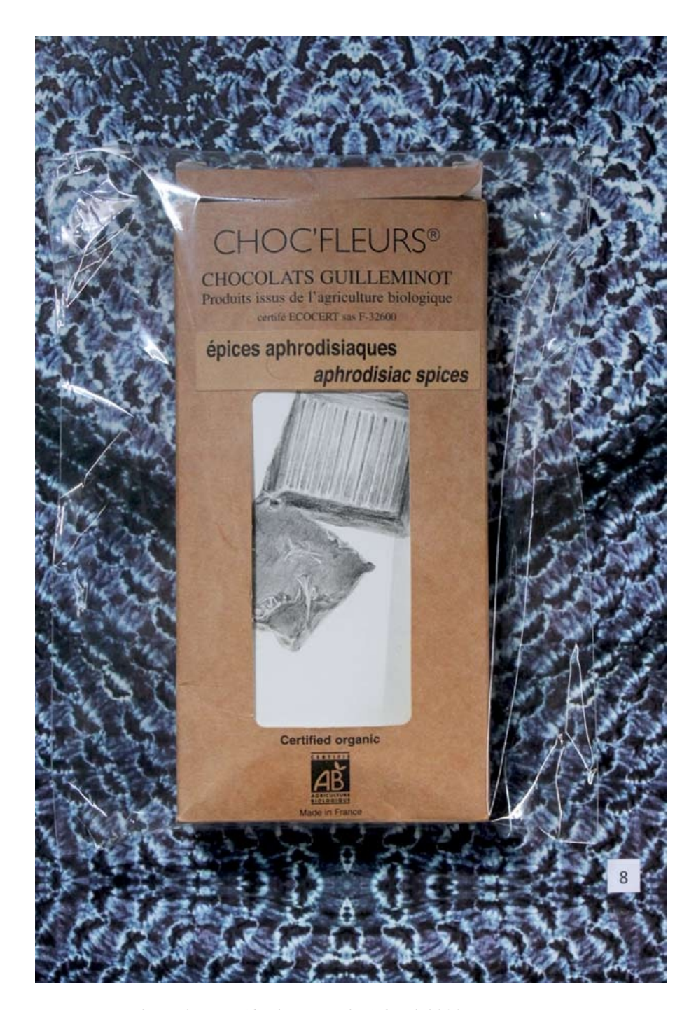
Temitayo Ogunbiyi, Elevator (Abeokuta to Dakar) detail, 2014