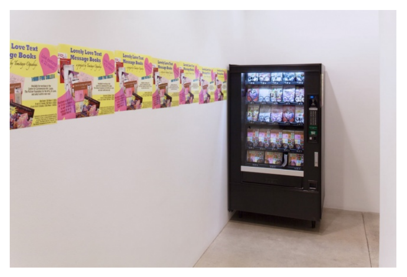
Temitayo Ogunbiyi, Lovely Love Text Message Books, 2013, Photograph by Sam Fenstress

Ogunbiyi operates a multi-dimensional practice that often manifests itself through site-specific mixed media works. Her practice employs drawing, fabric work and collage in order to reflect upon her interest in, \hat{a} ??in contemporary channels of communication, and how such interactions take place in public or virtual space. \hat{a} ?• Hence, \hat{a} ??interactions with particular communities, \hat{a} ?• allow her to reference, \hat{a} ??human habits, forms of growth and repeated gesture, \hat{a} ?• and her active participation in the exhibition installation is reflective of these performances.