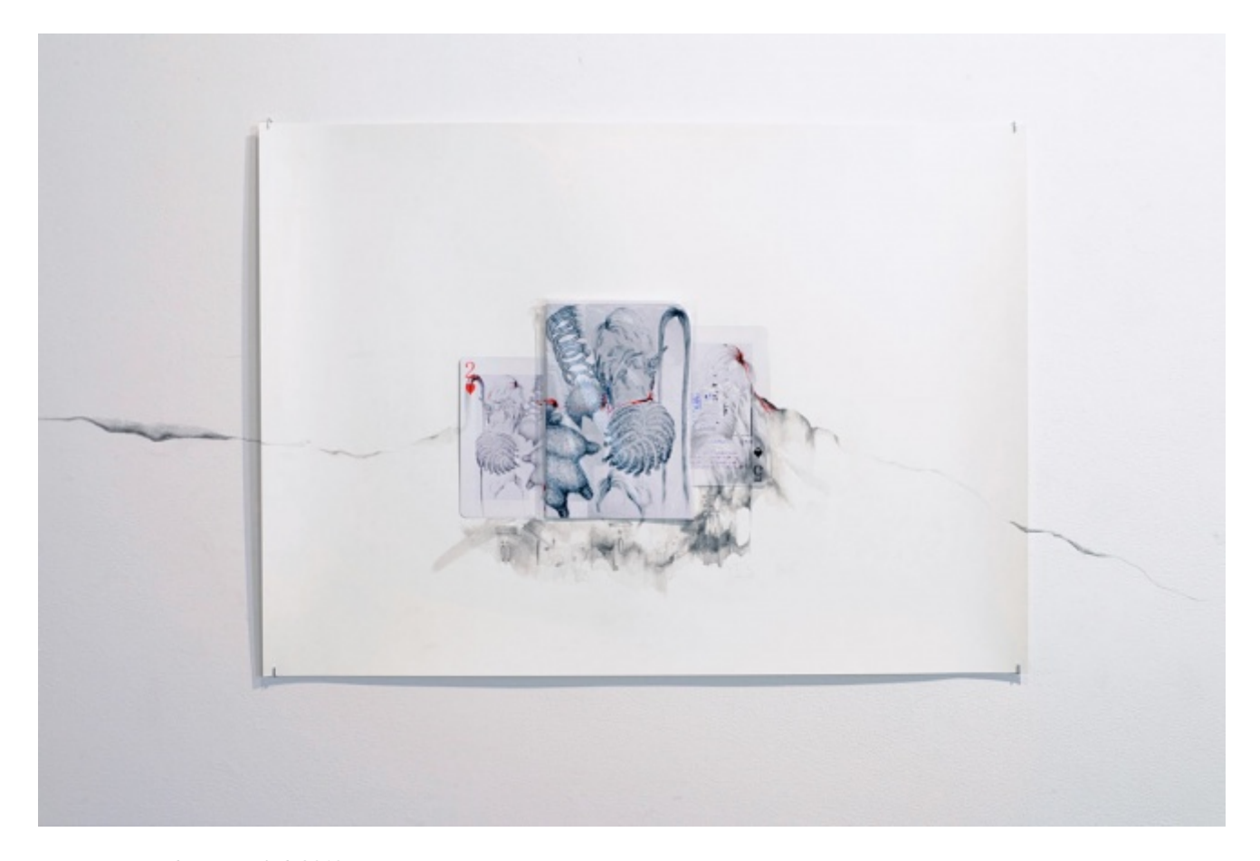
Temitayo Ogunbiyi, Untitled, 2013

Now living and working between Lagos, Nigeria and Yallahs, Jamaica, Ogunbiyi holds degrees from Columbia and Princeton universities in the USA and noteable exhibitions include Six Draughtsmen, Museum of Contemporary Diasporan Art Lagos, Nigeria (2013); The Progress of Love, The Pulitzer Art Foundation, St. Louis, USA; Center for Contemporary Art Lagos Keunstlerhaus, Bethanien, Berlin (2012); All We Ever Wanted, Centre for Contemporary Art, Lagos (2011) and New â?? Paintings, â? Boardroom, S&S Hotels and Suites, Lagos (2011).