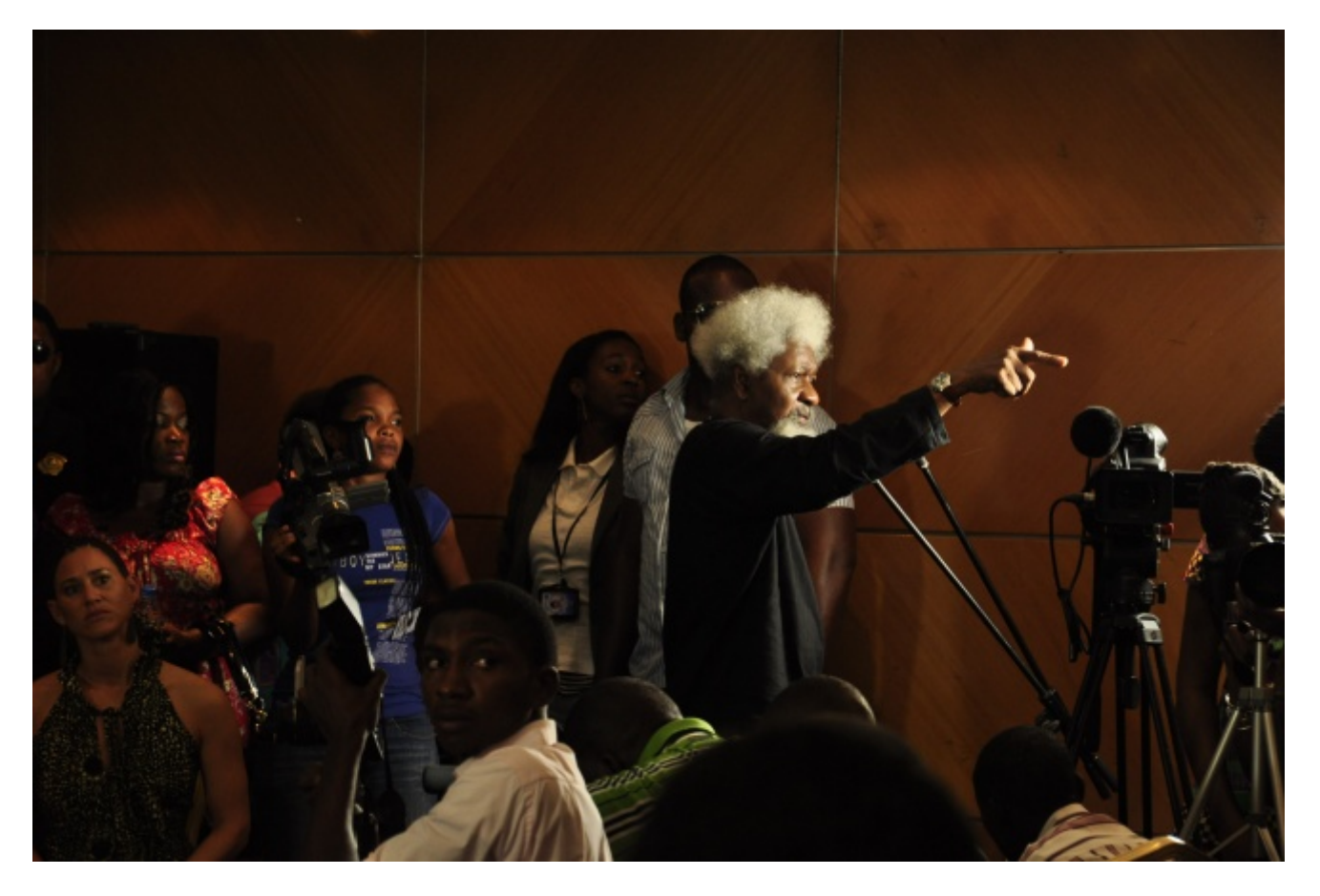
Wole Soyinka

Africa-concept or reality-is an acknowledged continent of extremes, and, by the same token, it is hardly surprising that it draws extreme reactions. Africans themselves are just as divided in their responses or strategies of accommodation-acquiescing, protective, resigned or fiercely defensive, identifying with, justifying or dissociating themselves from what is apparent or presumed to lie beneath the surface. The increasingly accepted common ground, both for the negativists and optimists, is that the African continent does not exist in isolation, not has it stood still in a time warp, independent of history. On the contrary, the continent is an intimate part of the histories of others, both cause and consequence, a complex organism formed of its own internal pulsation and external interventions, one that continues to be part of, yet is often denied, the triumphs and advances of the rest of the world.