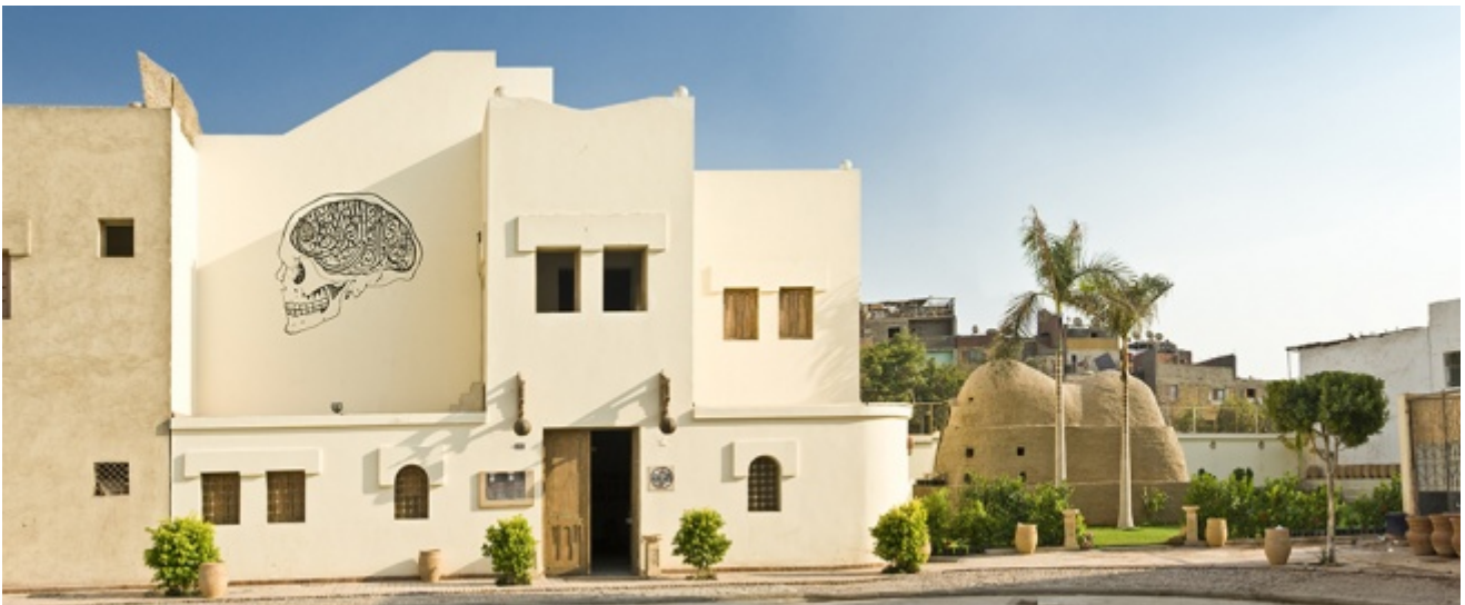
Darb 1718 Contemporary Art and Culture Center in Cairo

The scope and breadth of art programming in education in Egypt is miniscule. Contemporary art and critical writing are largely absent from the curricula of higher education. It is therefore not surprising that the artists of the Egyptian avant-garde, for example, have played a non-existent role in informing today's young art students. It wasn't until 2015 that an important conference on the Egyptian Surrealist movement presented a significant survey, for the first time, on a local art movement that would have otherwise been forgotten [3] . Many young artists in Egypt today rely quite heavily on the independent cultural institutions that provide workshops, lectures, screenings and spaces for exhibiting art. A new art discourse is taking form, a critical rhetoric, a reflective practice and, for the most part, it is not happening in our universities.